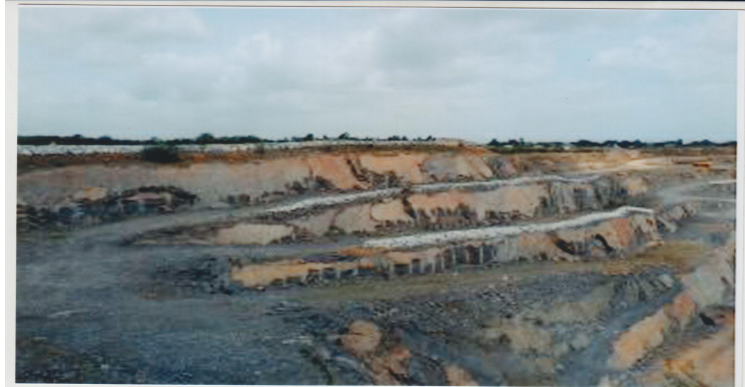
CHIKKASHELLIKERE LIMESTONE MINES