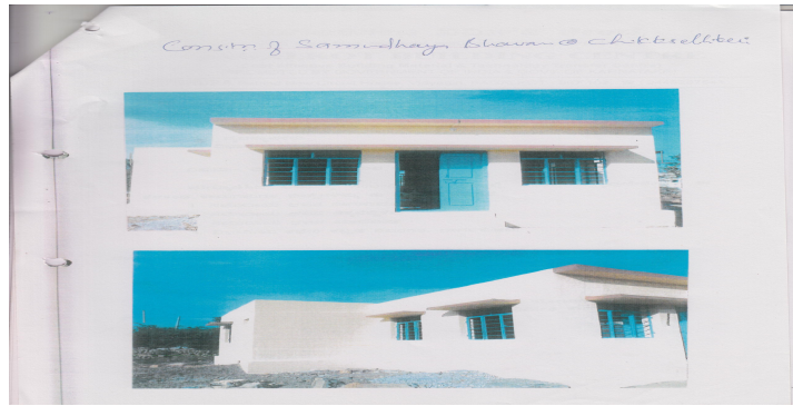
SAMUDAYA BHAVAN CONSTRUCTED AT CHIKKASHELLIKERE

The company has done welfare to the society through CSR works in and around the villagers near the mine.