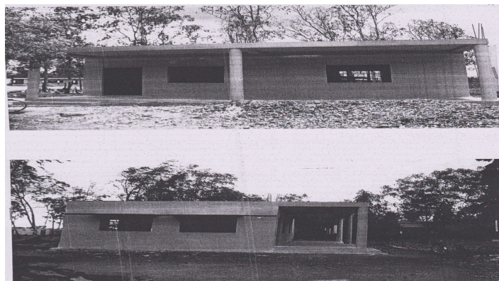
NEERALAKERE DOLOMITE MINES CONSTRUCTED TWO SCHOOL ROOM AT NEERALAKERE VILLAGE